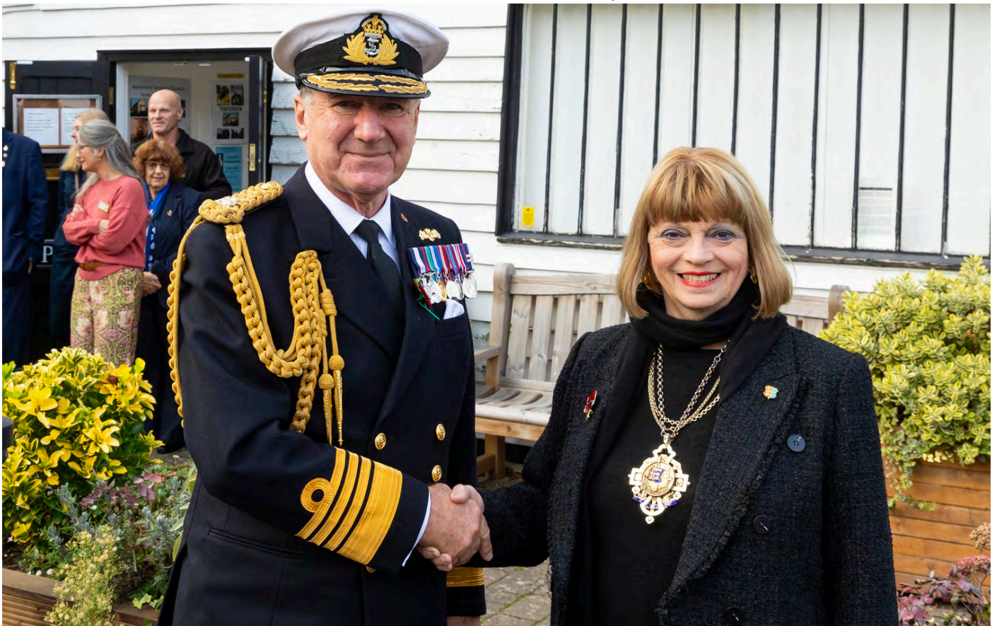
Admiral Sir George Zambellas with Cllr Sue Ferguson, Mayor of Tenterden

Following the installation of Admiral Sir George Zambellas as Lord Warden of the Cinque Ports on 29 October 2024, Sir George visited Tenterden as part of his packed tour of the 14 Cinque Port towns